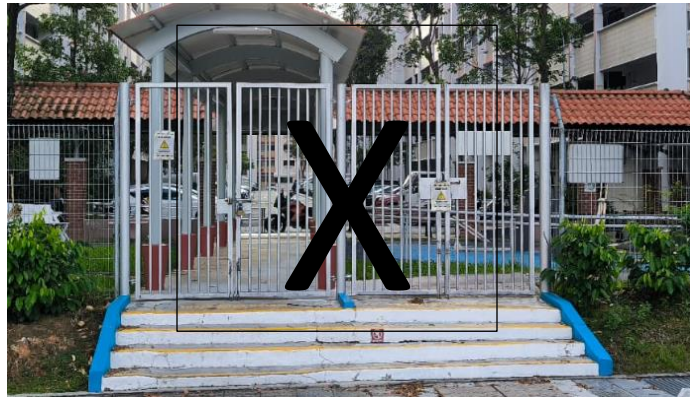
Closed Side Gate until further notice

Please note that the side gate will remain closed until further notice, upon the commencement of the Sheltered Walkway Project.