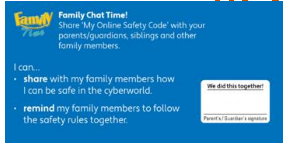
E.g. Family Time in the lesson on Staying Safe in the Cyberworld