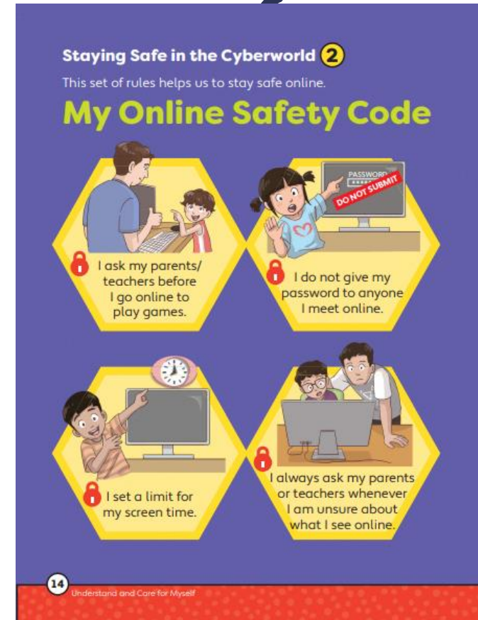
E.g. Lower Primary Lesson on Staying Safe in the Cyberworld